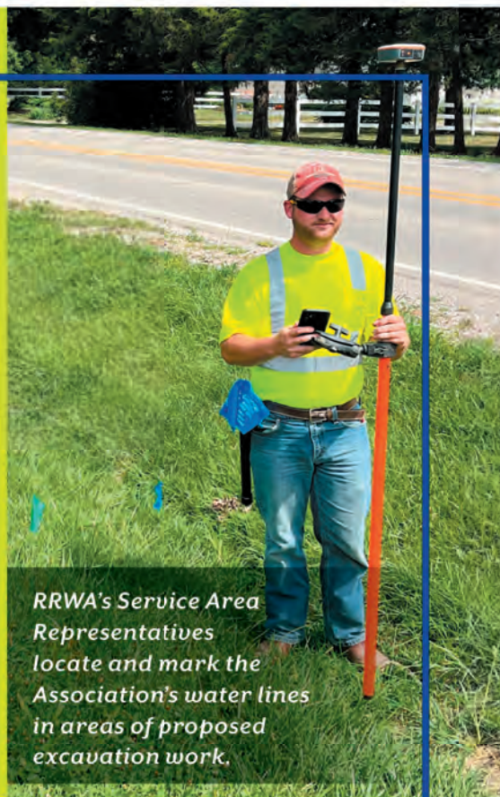
RRWA's Service Area Representatives locate and mark the Association's water lines in areas of proposed excavation work.

Iowa One Call is the law. Iowa law requires individuals, businesses, and others to notify the Iowa One Call System at least 48 hours (excluding weekends and holidays) before beginning any type of digging or excavating activities. Iowa law also requires all owners and operators of underground utilities to register their buried facilities with the Iowa One Call System. According to Iowa One Call, those planning to dig or excavate must mark the proposed work area using white flags. White paint, white stakes, or other suitable white markings may also be used. The Iowa One Call System requires utilities to use the different color flags to mark the location of their underground facilities near the proposed area of excavation.