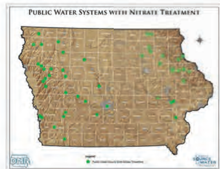
Almost 50 public water supplies in Iowa treat for nitrate, as shown with these green dots. Information courtesy of the Iowa Department of Natural Resources.

Sharing the stories of its members is important to provide perspective and understanding of what treating and monitoring water quality means on a daily basis.