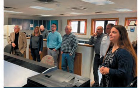
(ABOVE) State legislators and industry representatives toured RRWA's water treatment facility during the Iowa Water Industry Roundtable. (LEFT) RRWA hosted an Iowa Water Industry Roundtable which was attended by state legislators and water industry representatives.