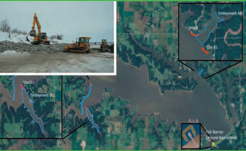
Walker Branch Wetland will restore wetland and upland at Rathbun Lake. The area is a significant source of sediment that enters the lake.

Projects currently underway at Rathbun Lake through the Section 1135 Program include additional shoreline stabilization and restoration as well as a barrier to limit out-migration of walleye and other fish species to preserve the lake's balanced ecosystem and high-quality fishery. In addition, the planned Walker Branch Wetland project, located in Wayne County, will restore close to 180 acres of wetland and associated upland to provide habitat, recreation, and water quality benefits, filtering runoff from 11,000 acres before entering Rathbun Lake. Partners will invest close to $15 million in these projects.