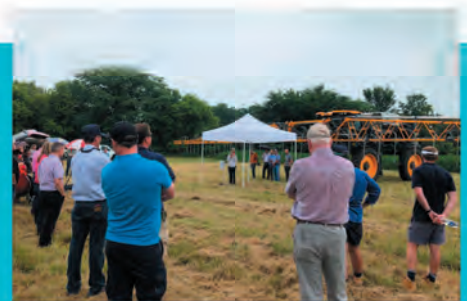
The Central Iowa Cover Crop Seeder project is a partnership among Des Moines Water Works, the city of Des Moines, Polk County Supervisors with the Iowa Department of Agriculture and Land Stewardship.